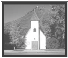
Chapel of the Holy Cross Original Minturn Church