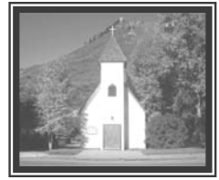
Chapel of the Holy Cross Original Minturn Church

Serving the community since 1913 and a parish since 1952